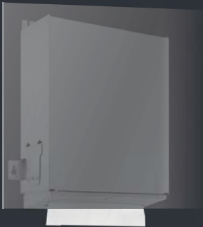
PAPER TOWEL DISPENSER WP 176-1 mounting behind mirror