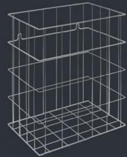
WASTE BASKET WP 201 35 liter