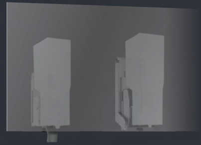
DISINFECTANT DISPENSER WP 174-7 mounting behind mirror