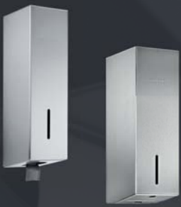
DISINFECTANT DISPENSER WP 102-7 surface-mounting