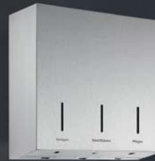
HAND CARE COMBINATION WP 575 surface-mounting SENSOR HAND CARE COMBINATION WP 575e surface-mounting