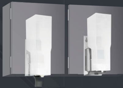
DISINFECTANT DISPENSER WP 173-7 mounting in cabinet